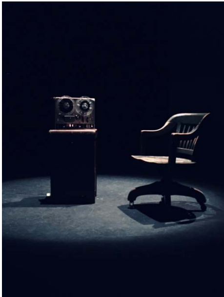
DAR HE: THE STORY OF EMMETT TILL