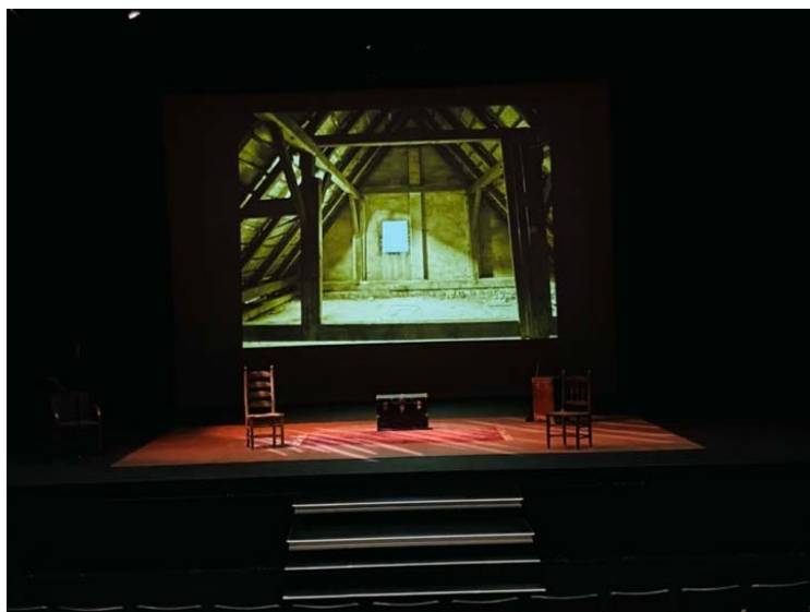
THE FIRE OF FREEDOM