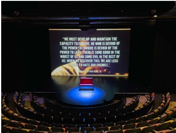
TIRED SOULS: THE MONTGOMERY BUS BOYCOTT