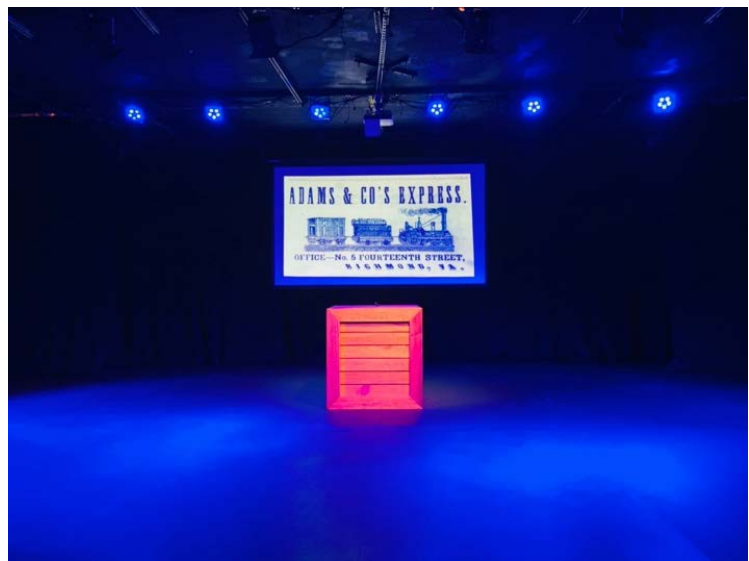
ONE NOBLE JOURNEY: A BOX MARKED FREEDOM